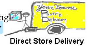
Direct Store Delivery

Unlike other packages, the DSD module is included in the IGManager Suite. With DSD, incoming product can be checked and the cost can be checked. Also, with receiving, the movement of any item can be viewed. This can greatly affect the $ return from any DSD category.